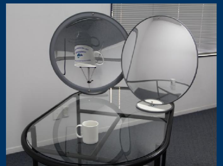
School Science Mirrors