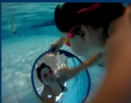
Learn to Swim Mirror

DOWNLOAD INFORMATION SCHOOL SCIENCE MIRRORS