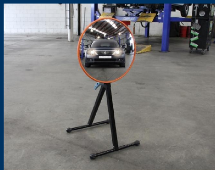
Portable Mirror With Stand